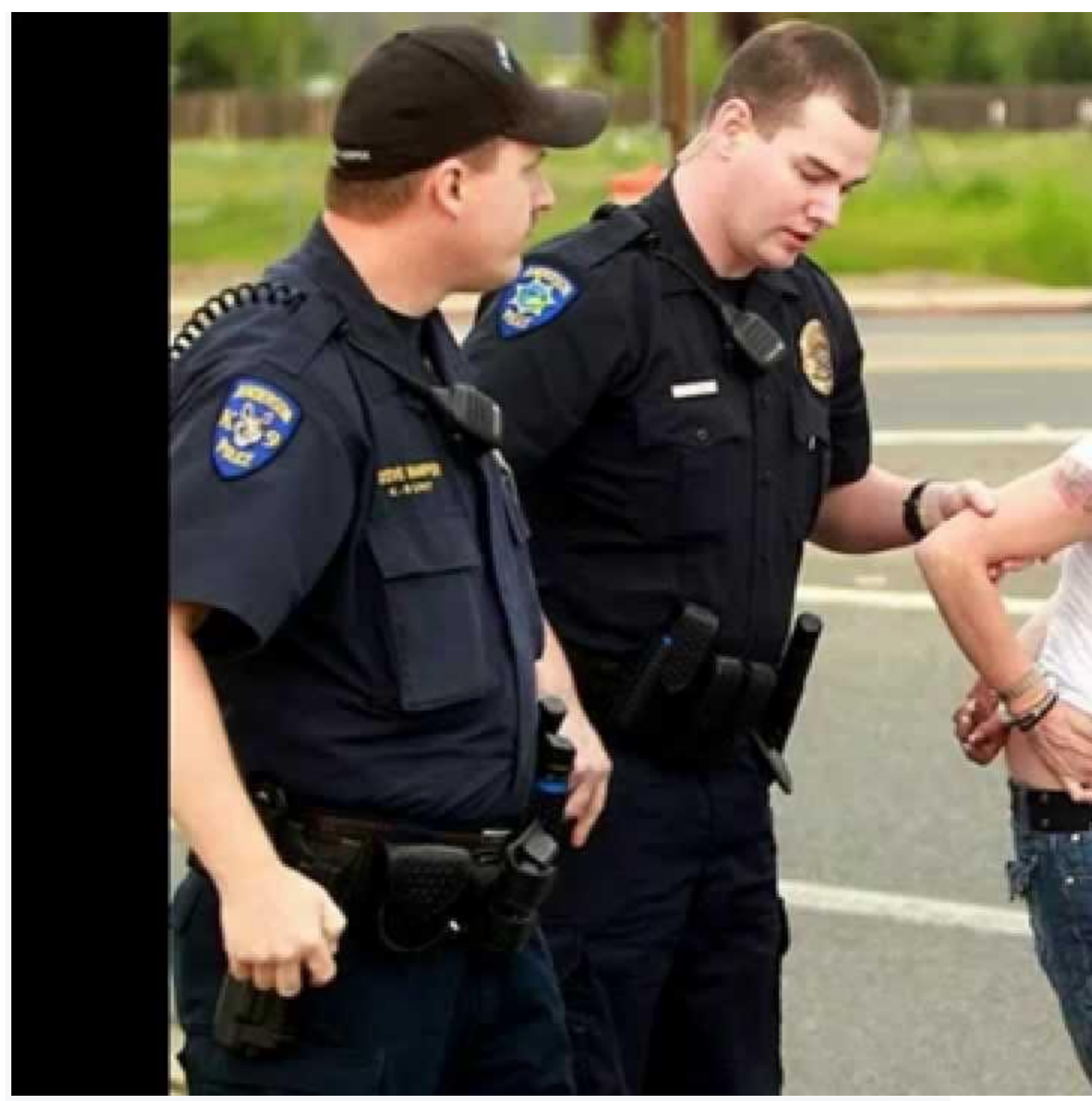
NC Arrests Homeless, Then Shipped To FEMA CAMPS! Get RFID CHIP or NO BENEFIT (Elvi Zapata) Homelessness is criminalized under the NC law and they will be arrested by the c... See More

April 2 at 6:57pm · Like · Remove Preview