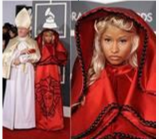
Top 11 Most Blatant Illuminati Music Videos & Performances