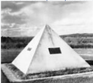
Religions: The Occult Connection