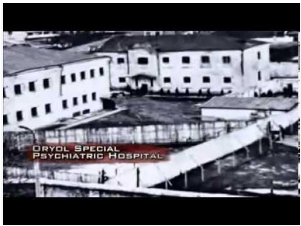
The Most SHOCKING Psychiatry Documentary EVER

June 5 at 1:19am · Edited · Like · Remove Preview