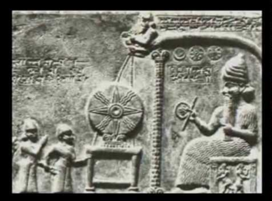
Scariest UFO Documentary Ever! - Conspiritus Remake by Xendrius - Proper / Full Version UFO (devil) Quotes: http://www.poweroftheair.com/quotes.htm Video by Xendrius: h... See More

Michael Swenson https://www.youtube.com/watch?v=uOx3Zdl4738