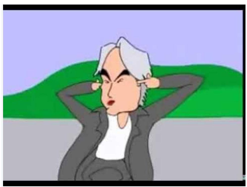
Atheism - Fingers in Ears Atheism summed up. Original video by http://www.youtube.com/user/mexicandruglord... See More May 25 at 3:42pm · Like · Remove Preview