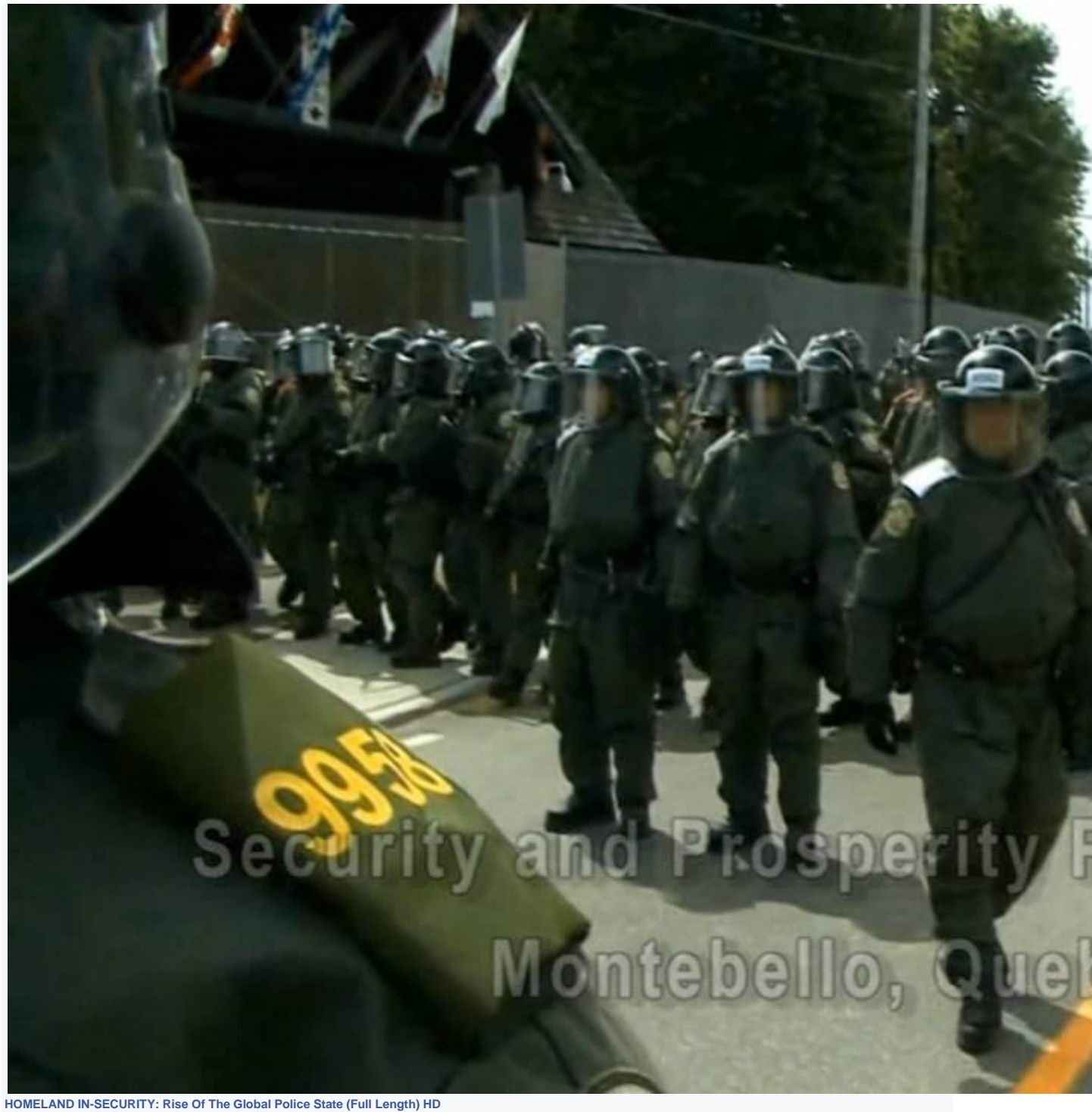
"HOMELAND IN-SECURITY: Rise Of The Global Police State" is nearly 3 hours long, ... See More

June 5 at 10:24pm · Like · Remove Preview