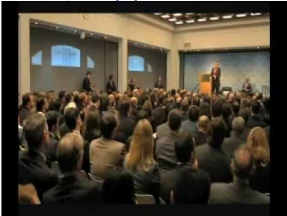
chuck missler & kent hovind VS UFO, atheist, illuminati, NWO, satanic government, THE DIVIDE Trailer 2012 chuck missler & kent hovind VS UFO, atheist, illuminati, NWO, satanic government, THE DIVIDE Trailer 2012

Michael Swenson https://www.youtube.com/watch?v=_i-VIDo9_OY