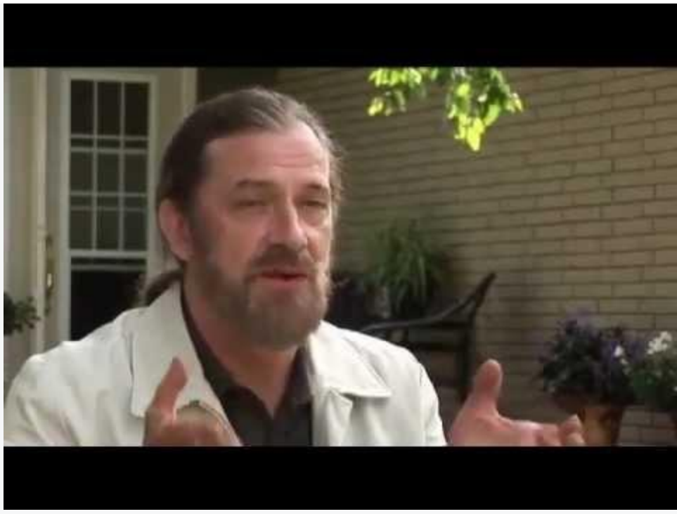
Alan Watt - A Globalist Agenda For a Dumbed Down Domesticated Society - A Prison Planet special Allan Watt is one of the most prolific researchers and educators on the subject ... See More

June 2 at 2:21pm · Like · Remove Preview