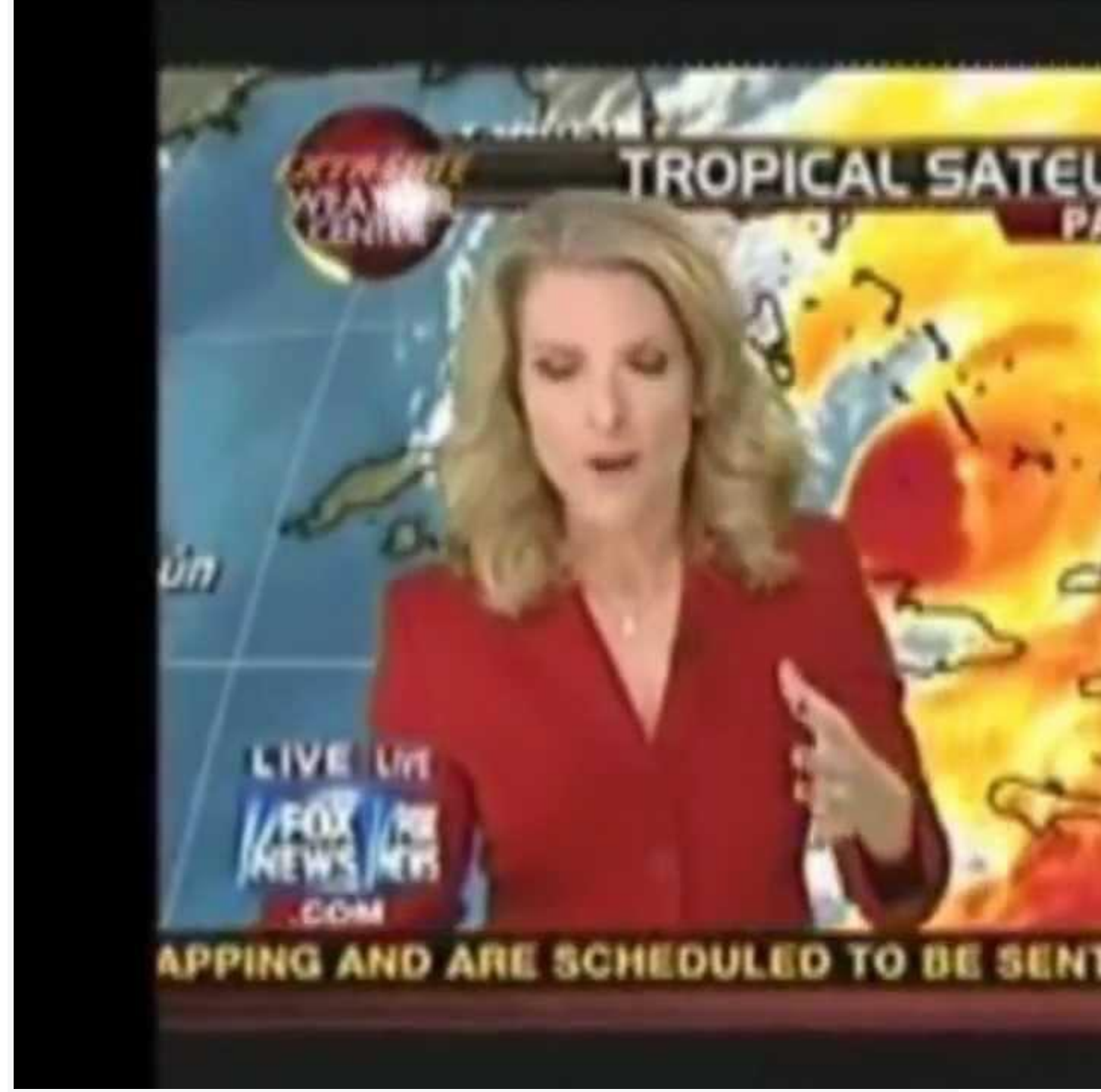
WATCH NOW "IN A NUTSHELL" if this doesn't scare you into reality, I don't know what will !!! Note: Daretoshare has moved to another channel Therealtruthseeker. To see my new... See More

April 2 at 8:15pm · Like · Remove Preview