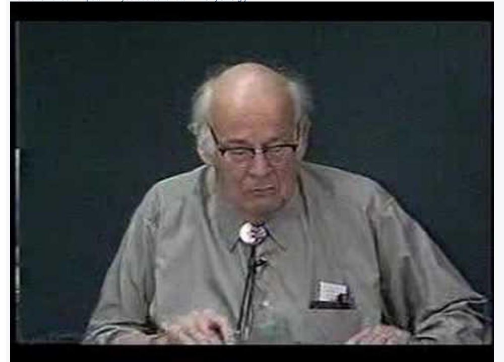
The Most IMPORTANT Video You'll Ever See (part 3 of 8) Featuring the famous, mind-blowing analogy of THE BACTERIA IN A BOTTLE. Part 3 o... See More