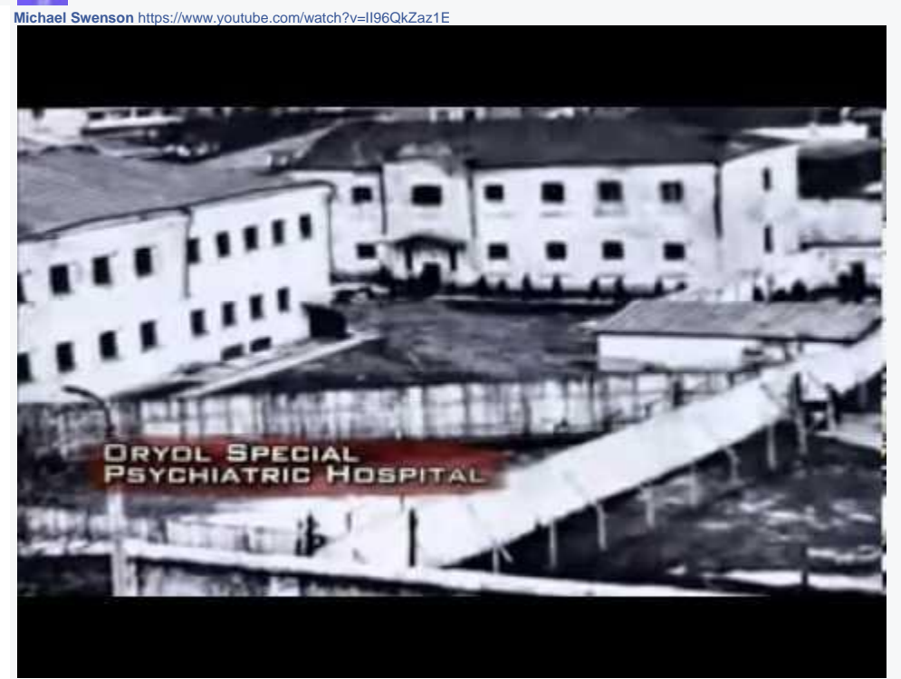
The Most SHOCKING Psychiatry Documentary EVER

June 5 at 1:17am · Like · Remove Preview