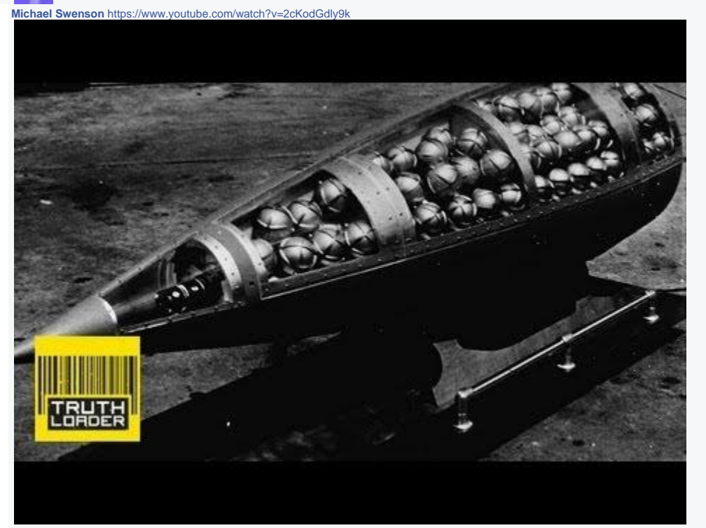
The Five Worst Weapons Still in Use - Truthloader OK, so this one is up for debate, but we've put together a list of the top five... See More

June 22 at 2:20am · Like · Remove Preview