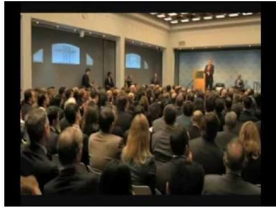
chuck missler & kent hovind VS UFO,atheist,illuminati,NWO,satanic government,THE DIVIDE Trailer 2012 chuck missler & kent hovind VS UFO,atheist,illuminati,NWO,satanic government,THE DIVIDE Trailer 2012

June 21 at 7:09am · Like · Remove Preview