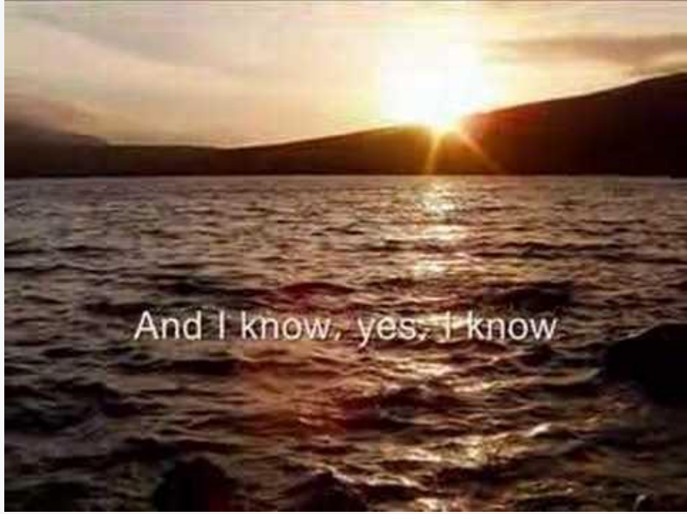
Yes, I Know